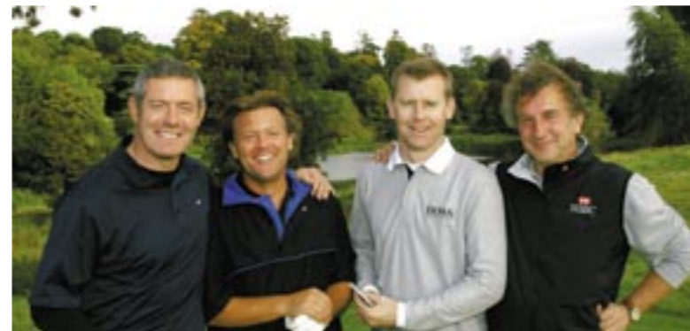
Right: Bird & Bird team